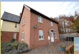
Newport, Essex 2 Bedrooms 68% share £210,800 (Under Offer)