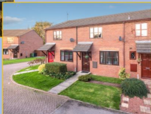
Tarpoley, Cheshire 2 Bedrooms 59% share £118,000