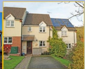
Dunchideock, Devon 2 Bedrooms 59% share £123,900